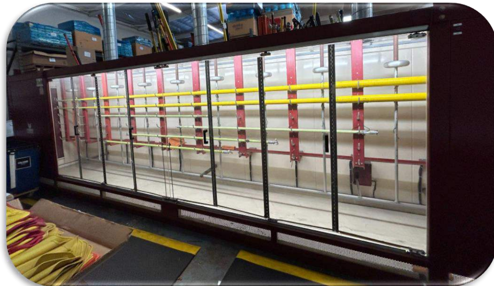
Figure 2 - Hotstick Dielectric Testing

Once the readiness of the hotstick or hot arm is confirmed, it undergoes dielectric testing in our specialized hot stick testing machine, adhering to ASTM F711 standards. This test evaluates the insulation properties by subjecting the stick to high voltage. Pass indicates acceptable insulation, while failure suggests potential dielectric issues. In case of failure, the stick requires remediation, often involving the application of a new epoxy coating to reinforce insulation. Defects are meticulously documented for analysis and remediation, ensuring all sticks meet safety standards before deployment.