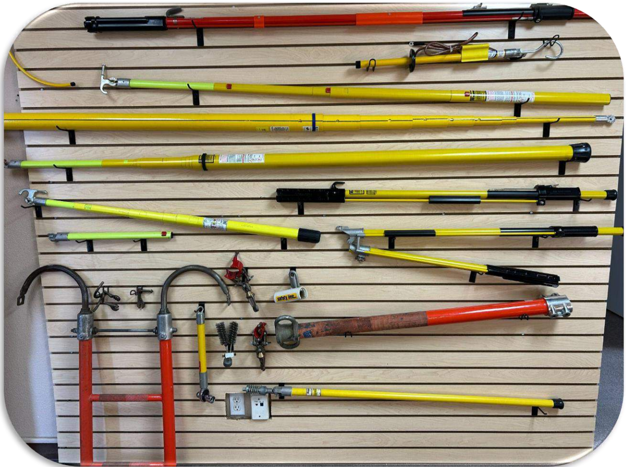
Figure 1 - Hotsticks

The testing process commences with the thorough cleaning of each hotstick and hot arm using a solvent. This solvent effectively removes all contaminants from the surface of the equipment, enabling technicians to assess its readiness for dielectric testing.