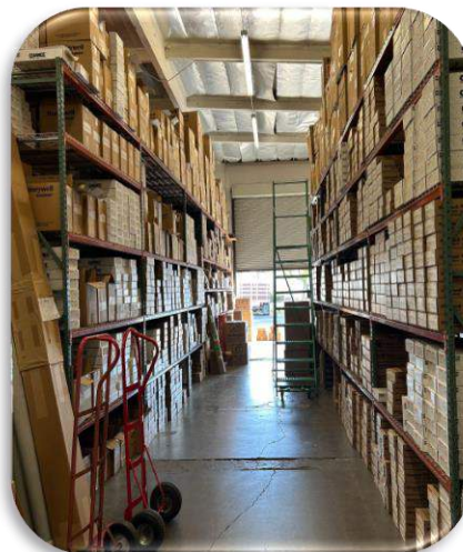
Figure 5 - Shipping or Pickup