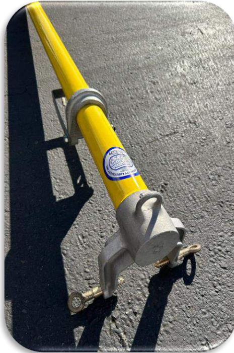
Figure 4 - Sticker Certification